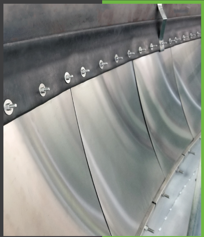
DirectFlex Secondary Metallic Wiper Seal

For more information, contact our expert team at 713-673-7701 (Toll Free 800-720-6629) or email sales@directtank.com .